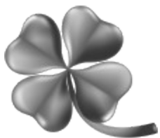
Kindergarten students used Lucky Charms to do some sorting and graphing activities. Math is the most fun when your materials are magically delicious!